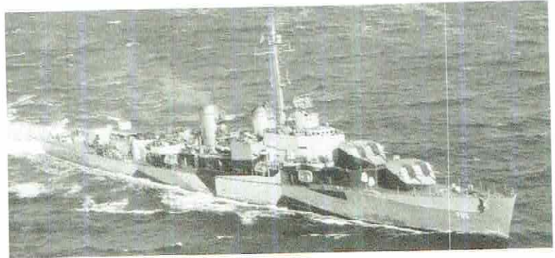
Commissioned November 4 1944 Decommissioned—September 27 1972