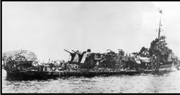
USS Laffey DD724—after Kamikaze attack...