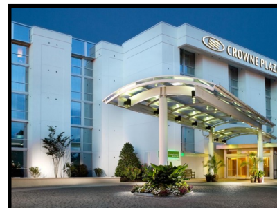
Crown Plaza—Charleston SC