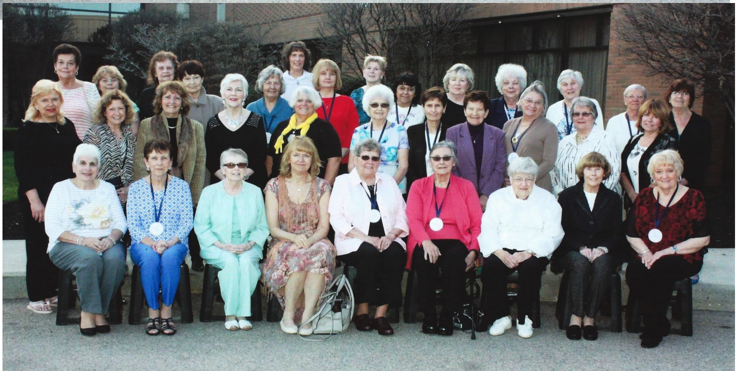
The Ladies of the USS Compton DD-705 April 2017 Reunion Warwick, Rhode Island