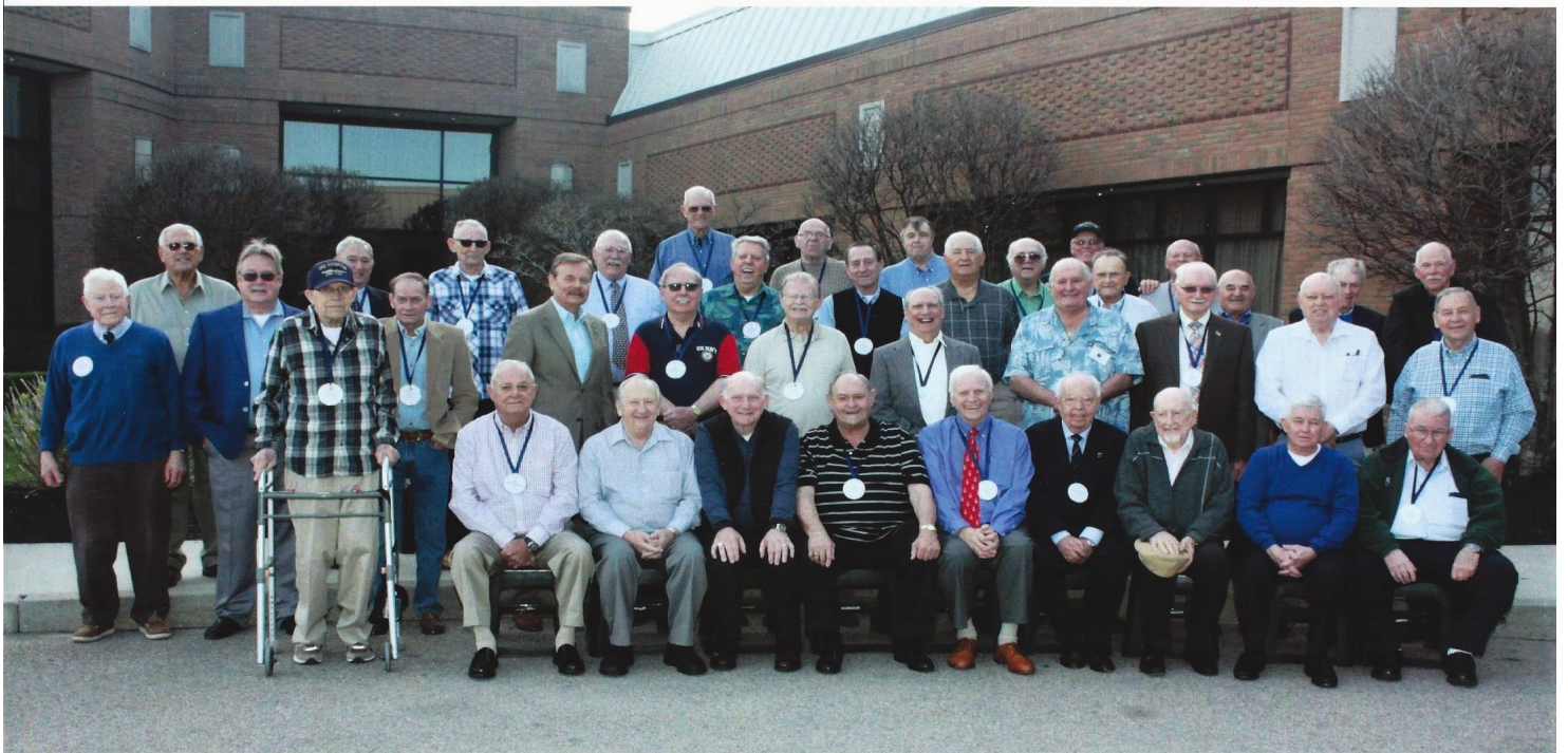
The Crew of the USS Compton DD-705 April 2017 Reunion Warwick, Rhode Island