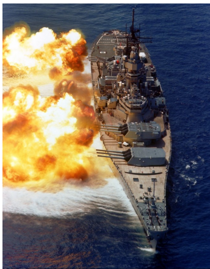
This picture may be the last "broadside" shot ever fired...

THE PURPOSE OF THE UNITED STATES CONSTITUTION IS TO LIMIT THE POWER OF THE FEDERAL GOVERNMENT NOT THE AMERICAN PEOPLE facebook.com/theRepublicanRevolution