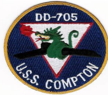
The Compton at war