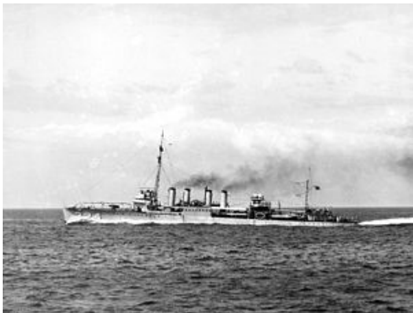
USS Stewart DD 224 Prior to WW2