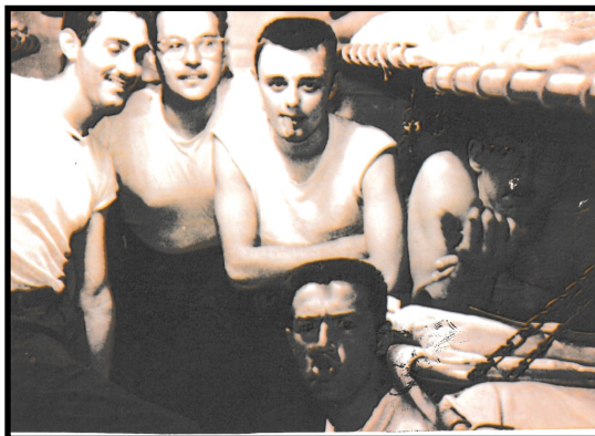
Looks like a plot forming in Engineering