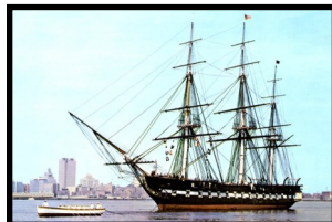
USS Constitution and USS Cassin Young DD793 Charlestown Navy Shipyard

Crowne Plaza Providence/Warwick 801 Greenwich Avenue Warwick, RI 02886 401-732-6000