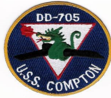
The Compton at war