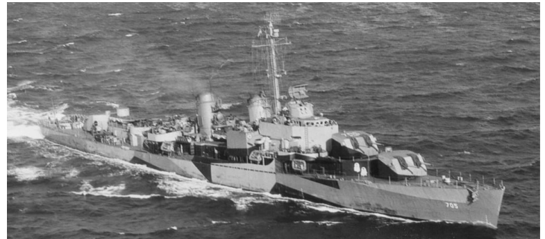
Commissioned November 4 1944 Decommissioned—September 27 1972