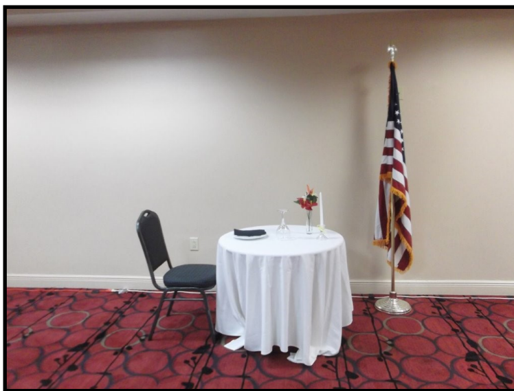
The White Table and "Missing Man" Ceremony A special ceremony performed at military functions that honor all missing and unaccounted members, for their service, to our country