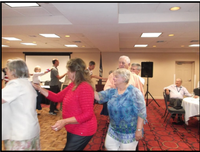
Compton Line Dance