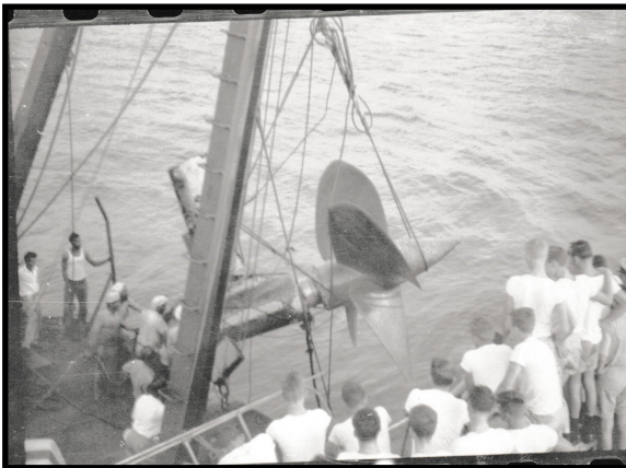
Ship's screw being lifted