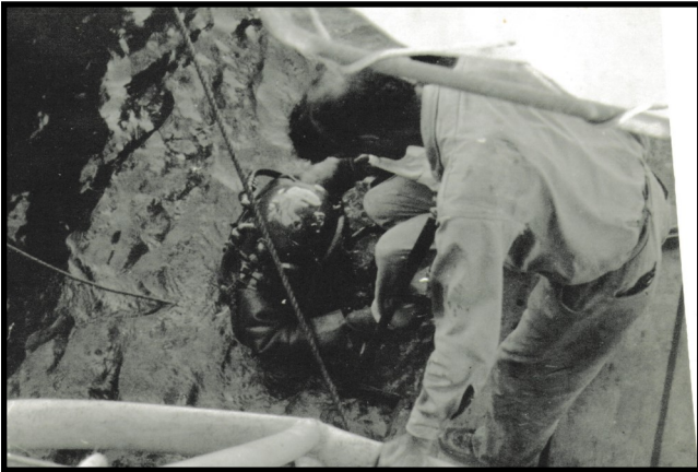
Diver prepares to cut free the damaged parts from our ship

A dive repair team and the necessary lifting equipment was necessary to remove the damaged screw and strut.