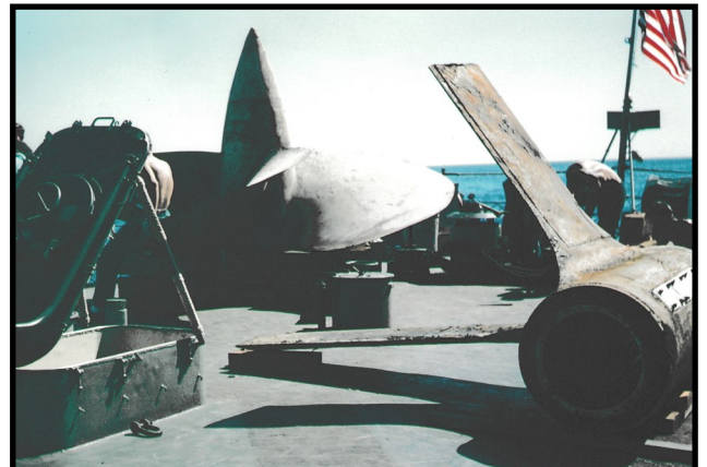
Damaged parts on fantail—Dry dock next stop