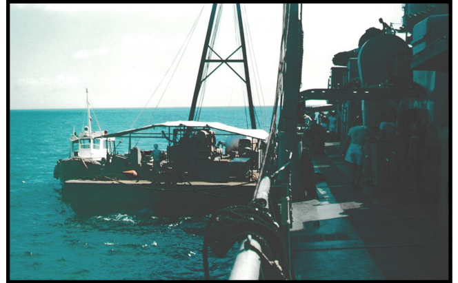
Barge and sea crane necessary to support the strut and screw while lifting from the water