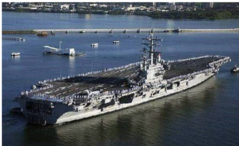
USS Ronald Reagan CVN-76 dwarfing the USS Arizona BB-39 Memorial while manning the rails in a salute to her honor!!