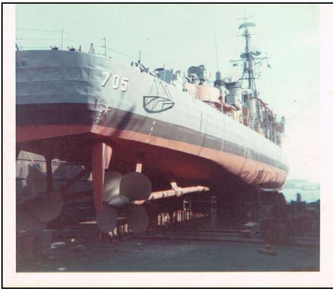
The Compton in Boston Dry dock