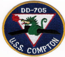
The Compton at war