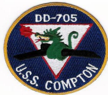
The Compton at war