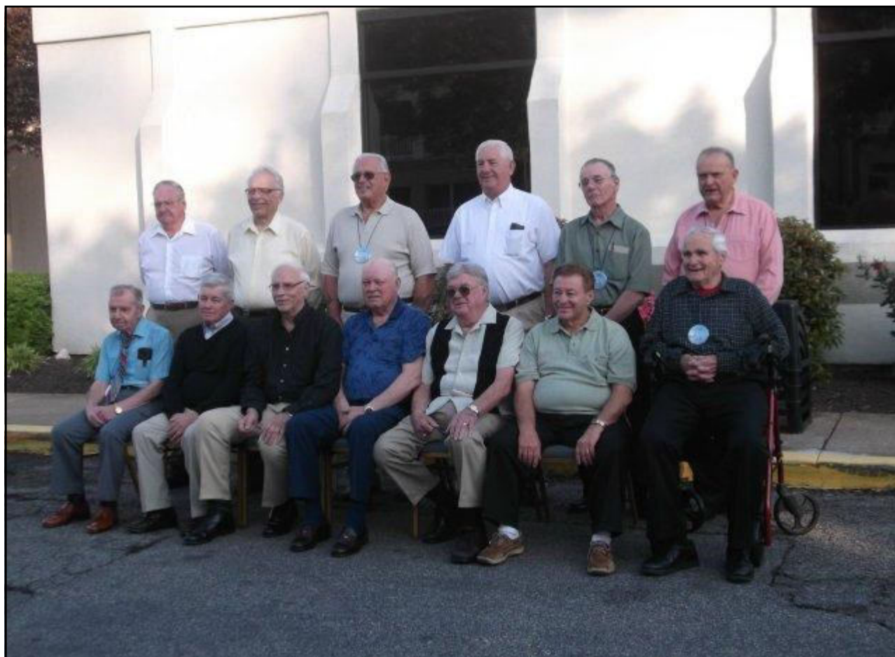
Compton crew members from the fifties!!!

Well, sir, if there was any work involved, the officers would have me doing it for them. "The room fell silent. God bless the enlisted man."