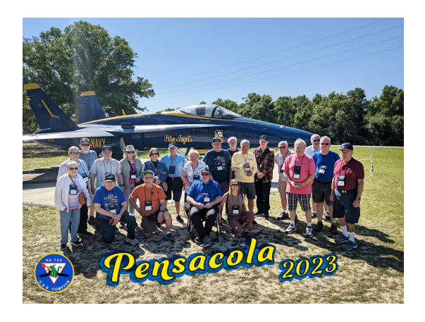
Blue Angel Commander's Actual Plane