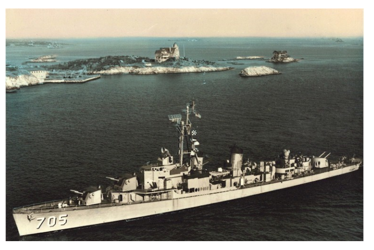
Compton returns home to Newport

Commissioned November 4 1944 Decommissioned—September 27 1972