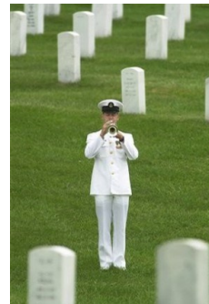
From the DD 705 to CV11 RIP brave sailors