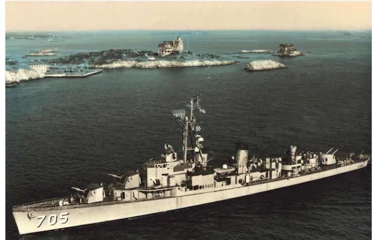
Compton returns home to Newport

Commissioned November 4 1944 Decommissioned—September 27 1972