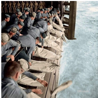
USS Intrepid CV11 Burial at sea 1944 after a Kamikaze attack