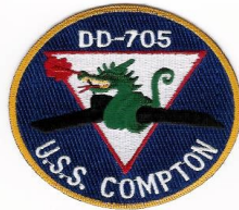
The Compton at war