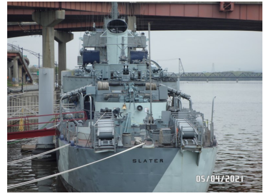
USS Slater DE766—the crews choice

Dutch Apple Cruise Compton members cruise the mighty Hudson River and it's very scenic views