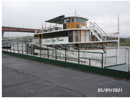
Bob's choice for our cruise